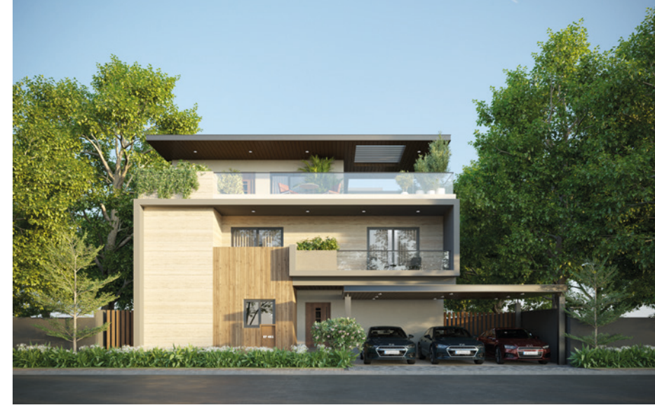
481 sq.yds - East Facing