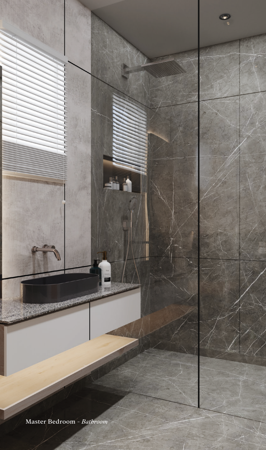
Master Bedroom – Bathroom