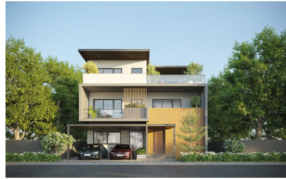
500 sq.yds - East Facing