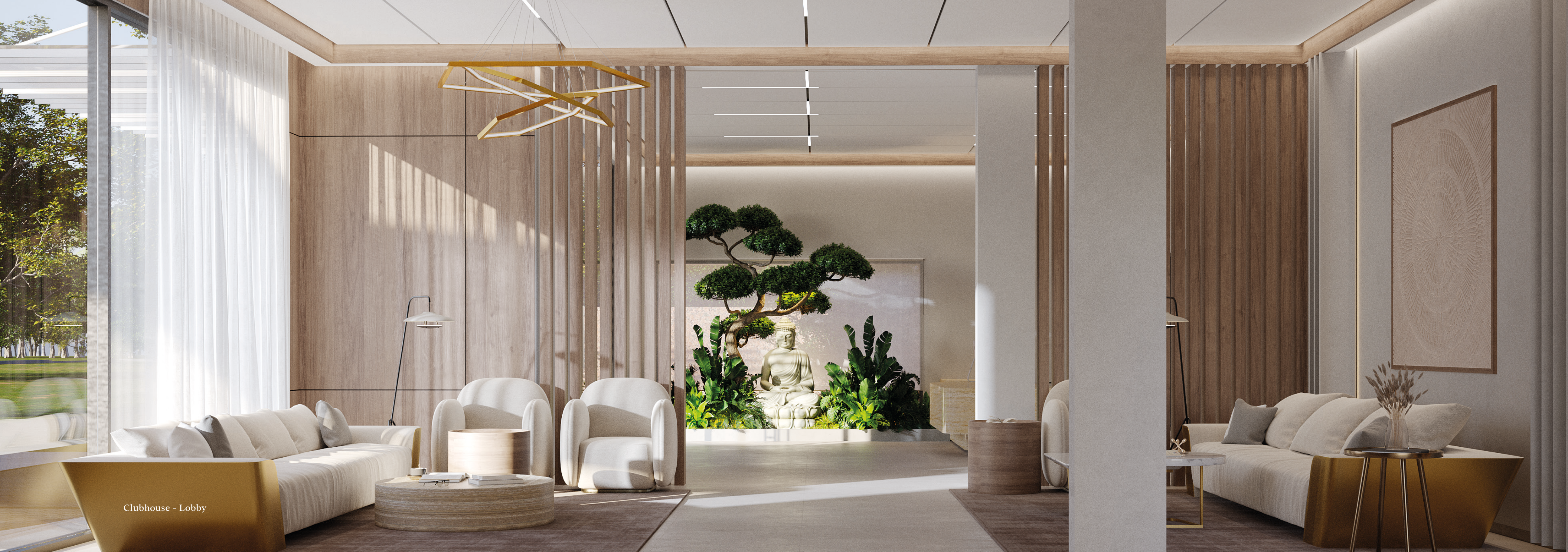
Clubhouse - Lobby