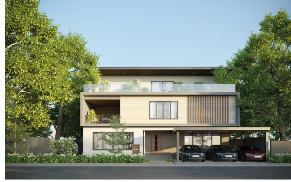
433 sq.yds - North Facing