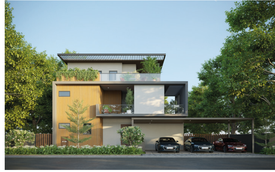
625 sq.yds - East Facing